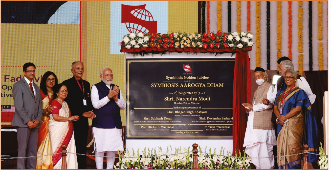
Symbiosis Aarogya Dham inaugurated by Shri. Narendra Modi, Hon'ble Prime Minister of India.- 06 March 2022